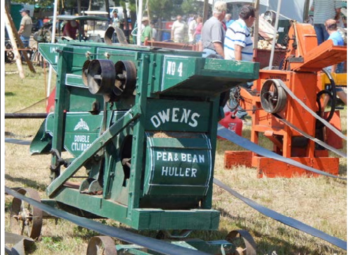
The Nobbs-Kruse display seems to have something new and different every year. This time it's this Owens Pea & Bean Huller, Improved No. 4, with double cylinder.