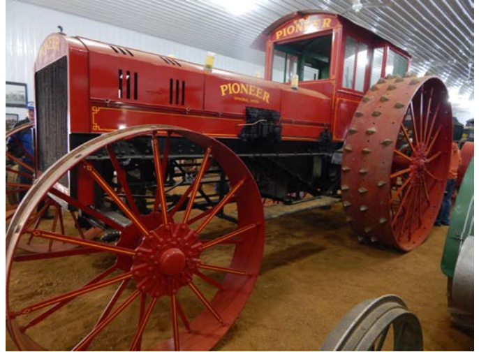
This very impressive 30-60 Pioneer tractor was built in Winona, MN, and is part of the Kass collection.

and try to keep the middle of the first week of April free.