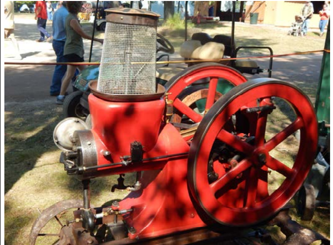
This unusual 4 h.p. Moore Gasoline Engine was made by the Moore Plow & Implement Co. of Greenville, MI.