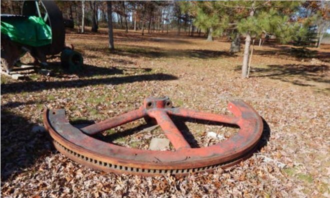
The Vilter steam engine has been moved inside the Steam Shed, but the flywheel was still outside when these photos were taken last week.