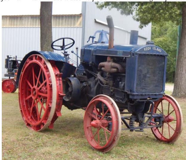
This 15-25 Rock Island tractor rather mysteriously appeared this year. It was made by the Rock Island Plow Company, ca. 1927. Owner is unknown.