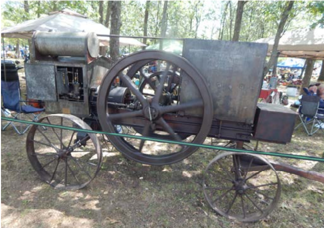
Back in a quiet corner of the engine exhibit, was this rare 8 h.p. Flour City engine, manufactured by Kinnard-Haines Co. of Minneapolis.