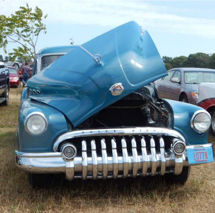
Ooh Grandma, what big teeth you have! This ca. 1950 Buick is pretty amazing, complete with side opening hood, bomb sight hood ornament, and VentiPorts. A beautiful car to go cruising in! Owner unknown.