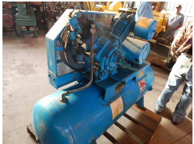
The Club also received a donation of this very nice 10 h.p. LeRoi compressor, a Lodge & Shipley engine lathe and a small Kearney & Trecker horizontal mill, which was made in Milwaukee.