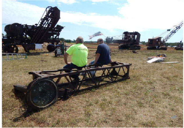
The perfect spot and the perfect seating to watch the Sand Box action.