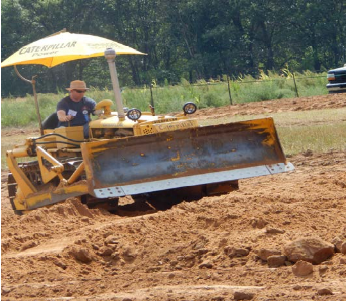
Man and machine in the Sand Box. Every kid's dream...