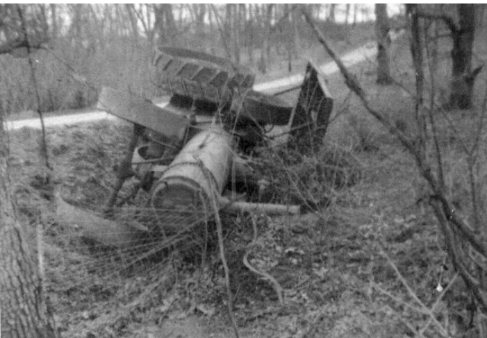
A sad sight, but not as bad as it looks. The 65 hp Case is still operating at the Rock River show.