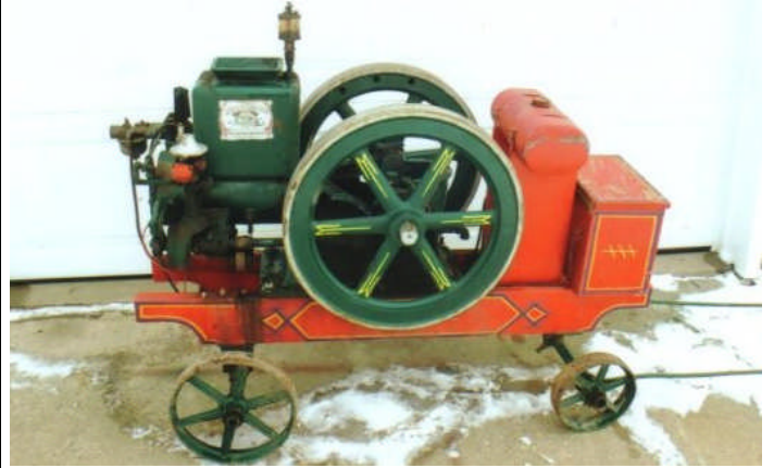
Lauson-Lawton side shaft, 2 1/2 h.p. on cart

Auction info: The Glenn Oestreich Collection of engines, tractors and models will be auctioned off on Saturday, May 1. The sale will also include many consigned items. Preview begins at 8 a.m. Engines will be running between 10 a.m. and the beginning of the sale at 11. No items for consignment will be accepted on the day of the sale. Only steam or gas engines, tractors, implements and related parts, and related memorabilia or literature are accepted for the auction. No household items or other unrelated goods will be accepted for consignment. Help will be needed on Saturday morning to move engines and other items out of the Feature Building to the sale area. Call Mark Beard at (608)356-6115 if you want to help or if you have something to consign. You can get a preview of the sale items at www.badgersteamandgas.com