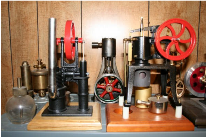
A sampling of the steam engine models from the Glenn Oestreich Collection

Swap Meet info: Friday, April 30 is setup day, with the gate opening at 8 a.m. Sellers will still pay only $20 for one truckload and one trailer load. Some indoor space may be available. On Saturday, more sellers will be arriving and the gate opens at 6 a.m. Help will be needed there to help check in sellers. Call Kevin Haarklau for more information (608) 635-3908.