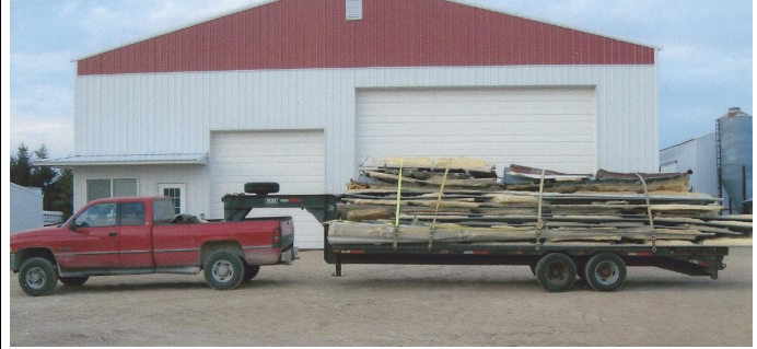
A load of metal siding is on its way to be sold for scrap.