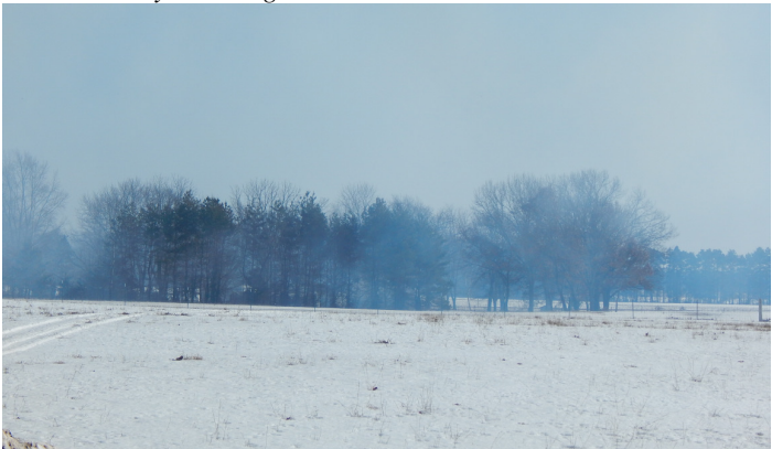
Despite their best efforts, they were unable to smoke out neighbor Paul Young...