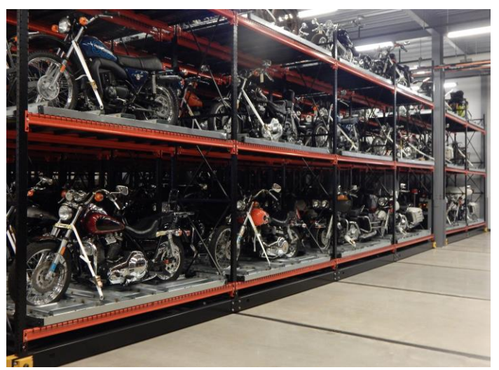
Another behind the scenes shot. This is a small part of the compact storage for the many bikes that are not on display at this time.