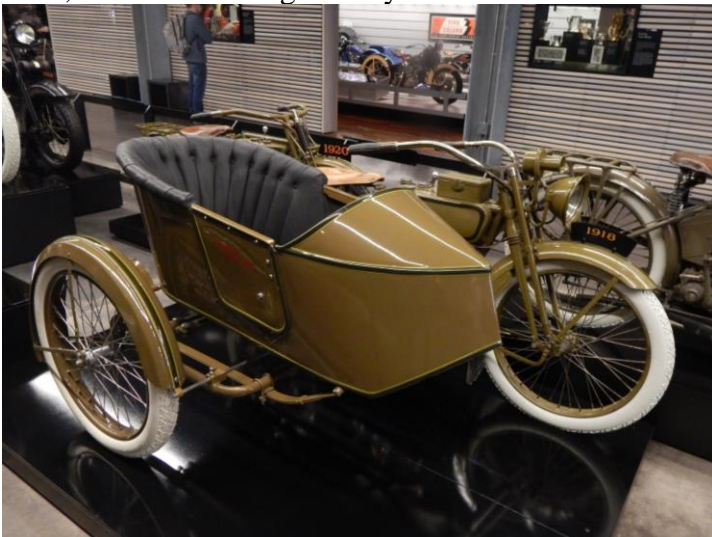
This 1918 Model J sports a beautifully upholstered J.W. Rogers side car, a $90 extra. A special engine with more torque was recommended to accommodate the side car.