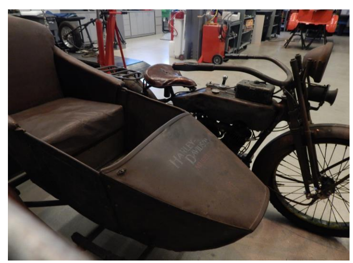
What can I say – I like old bikes with side cars. This photo was taken through the chain link fencing around the restoration work shop, during the "behind the scenes tour". It has that dark patina of age which should not be disturbed, and still has visible original decals.