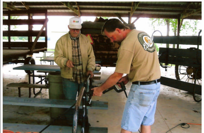
Top: The Charles Ploetz Barbwire Collection