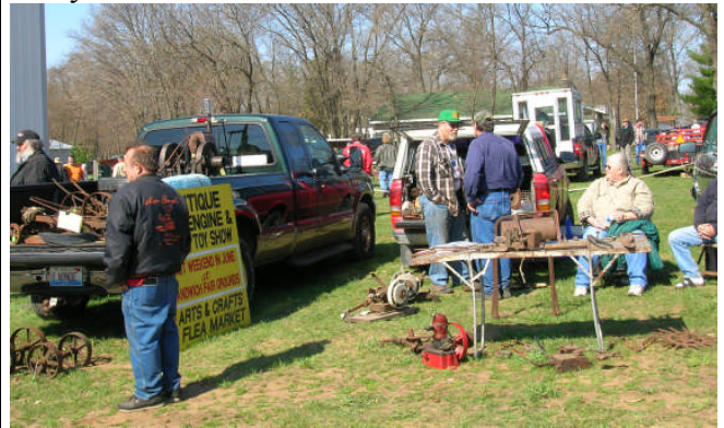
There was a whole lot of shoppin' goin' on ...

The Swap Meet, the Auction and the Club food stand were all very successful this year. There were 263 vendors for the swap meet, the most we have ever had. The weather was great, so we had a lot of people who seemingly all ate at the Club food stand! Since we don't charge admission, it's always a little hard to judge the size of our crowd but the food stand was really, really busy and made a record profit. There were 45 pies donated, and every single piece was sold, the brownies (28 pans of them) went too. We ran out of brats, sold out of pork... let's just say there were not many leftovers!