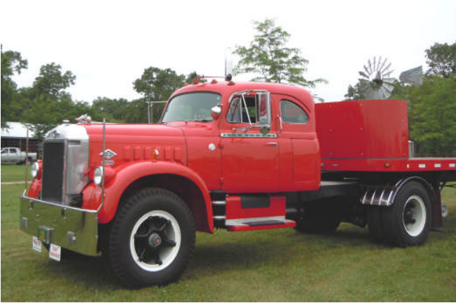
This nice Diamond T truck was one of many trucks on display at the Antique Truck Historical Society show at our grounds June 11-12.