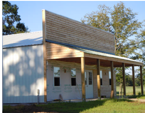
July 21 – the Women's Building, still under construction but getting close to completion.