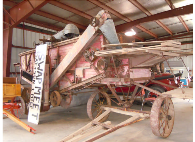
A new addition to the Club's thresher collection, this is an early steel frame hand feed thresher, and it's a big one. It will be in use at this year's show.