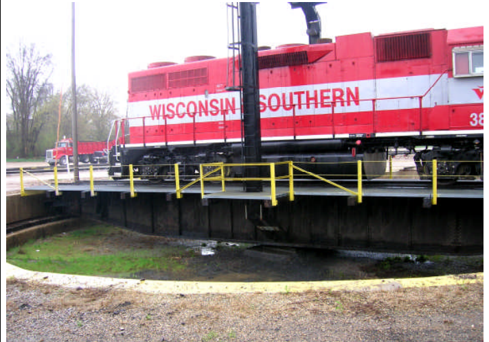
An engine on the turntable at the Wisconsin & Southern Roundhouse. This is one of the very few turntables still in operation.

the turntable, since the rain had slackened a bit. They operated the turntable for us, so we got to see the big locomotive going around and around. It was impressive. The rain suddenly started coming down much harder, so we headed back inside where the guide showed us parts of the locomotive engine, and answered a lot of questions. He opened the side panels of the engine and showed us how they inspect the engine, and test for problems. We were there about an hour.