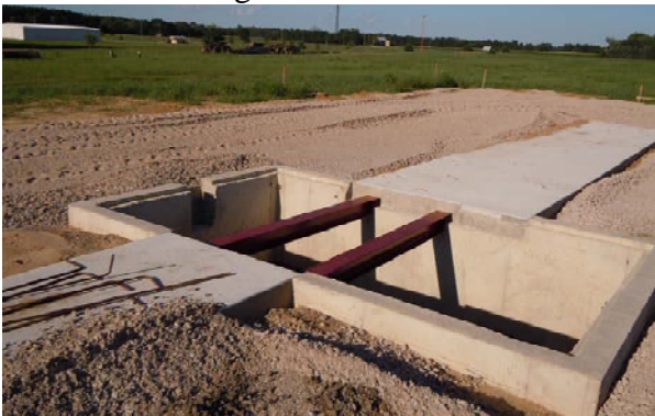
Another exciting hole in the ground picture for the newsletter...but actually it is exciting, because it means progress has been made on the saw mill installation. Here concrete has been poured for the sawdust pit, and gravel is also being put down. Looks good!

In the process of moving the sawmill pieces out of the Machine Shop building, some cleaning is also being done. Parts of this building will be in use during the show for the first time since it has been built. The Steam Engines for Kids project will be in this space. If you have any personal property stored in this building, now would be a good time to remove it.