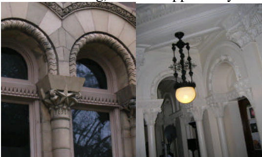
Exterior and interior views of the architectural details at Yerkes.

When we arrived at Yerkes Observatory, it was raining just enough that you didn't want to stand around in it, so of course the front door was locked. Karl found someone around behind the building, and we got in eventually. The building is truly beautiful, with columns along the outside with star clusters on the capitals. Signs of the zodiac in relief also are part of the exterior decoration. The entry hall had gorgeous, ornate light fixtures with hand blown opalescent glass globes and lots of ornate plasterwork. The library was a very pleasant room in the Arts & Crafts style. We then climbed a fairly long, steep staircase to the largest dome, which houses the largest (40 inch) refractor telescope in the world. The floor of the dome is actually an elevator, 75 feet in diameter, which he raised and lowered for us. The elevator raises astronomers to the eyepiece of the telescope. The dome rotates on a track, sounding somewhat like a train when it moves. He did not open the dome, as there was some concern it might not close properly and leak. A motor in the basement powers the elevator, etc. At the end of his talk, we asked if we could see the motor in the basement, and he did take some of us down there. After the visit to the museum gift shop, of course. There was some dismay in our group when it was discovered that an old steam engine and boiler (in another building) were scrapped only a few years ago.