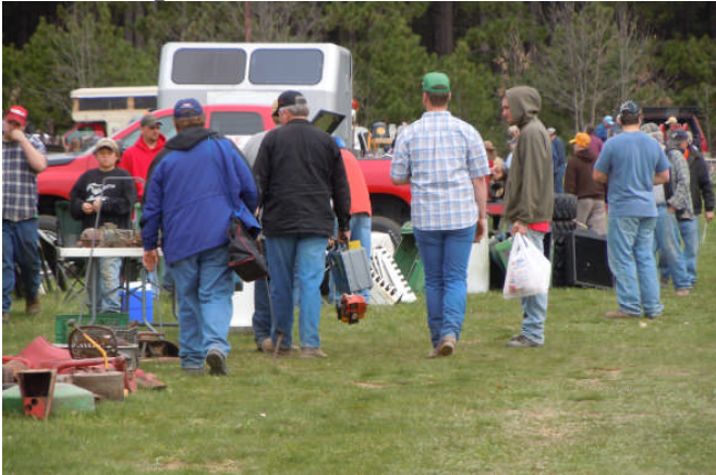
Busy shoppers at the Swap Meet.