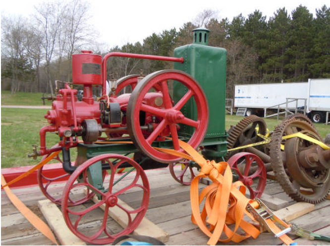
Another interesting gas engine on the scene was this Lorenz, made in Czechoslovakia.