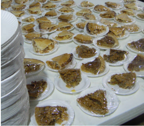
A whole lotta pie was sold...