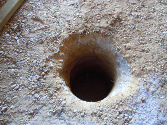
Another hole picture for the collection I've built since I started editing this newsletter! This is one of six for footings for the log deck, and three others to support the input power shaft. All are 4 ft. deep, 18 inches across. They were drilled by Allen Steele's employees. Thank you once again Allen!