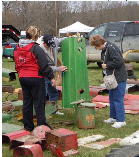
Looks like somebody was planning ahead for the John Deere Feature! Or maybe he was buying his wife an anniversary gift?