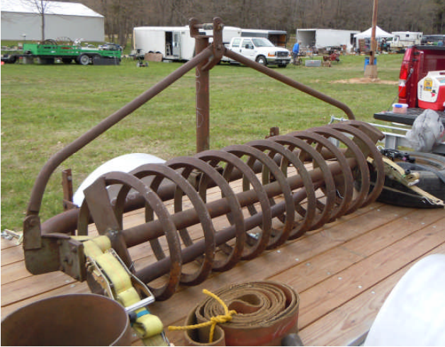
This unusual clod buster looks like it is a rare item. The seller said it was sold by Sears & Roebuck, if I remember correctly.