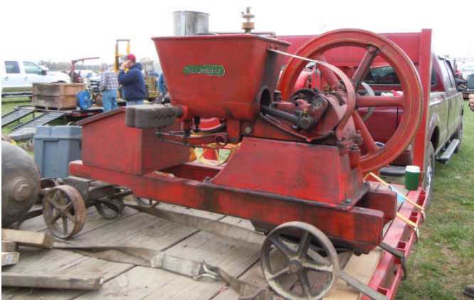
And a New Holland too.