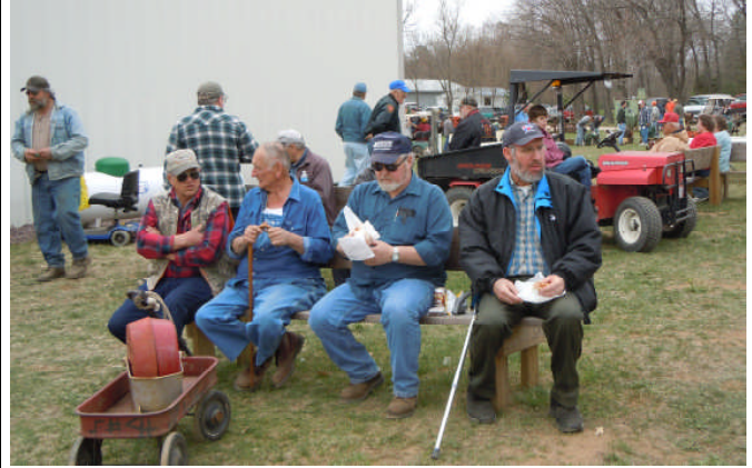
Benches outside the Feature Building were a popular spot to eat lunch, or just to set a spell and discuss hog oiler purchases.