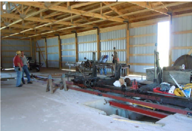
A more general view of the interior; note the beautiful job on the hard packed floor, also done by Allen Steele's workers.

The Print Shop floor will be poured next week, and the building will be moved from its current temporary