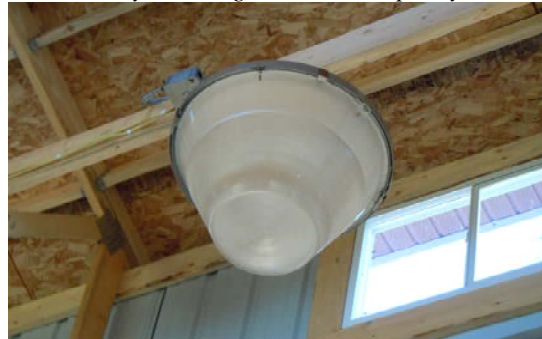
One of the new lights in the Sawmill Building, installed by Lyle Opperman and helpers.