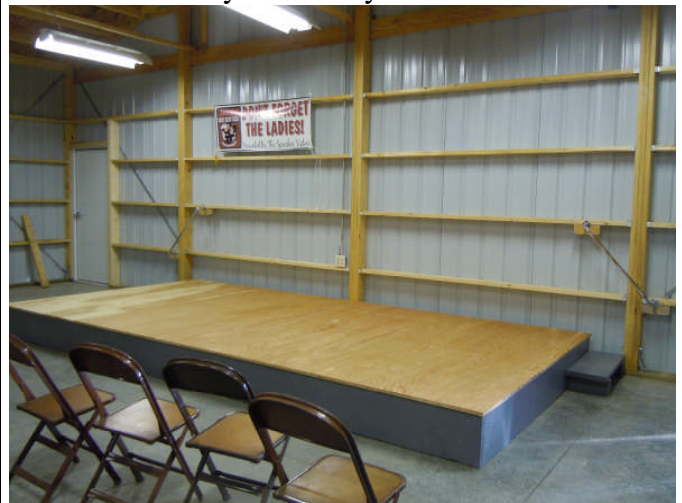
Note the hand railings for the steps up to the stage!