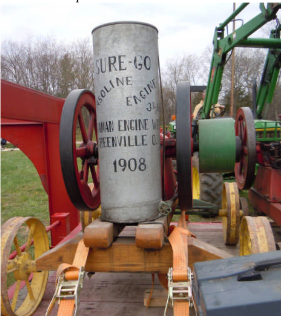
This 3 1/2 hp Sure-Go Gas Engine was made in 1908 by the Wogeman Engine Co. of Greenville, OH. What a sweetheart!