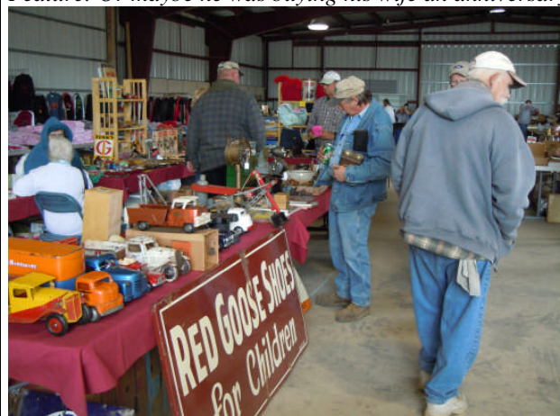
Inside vendors had some interesting items also.