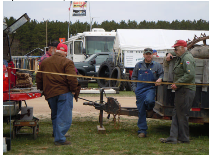
After a long day of shopping 'til dropping, it's always good for the guys to have a little visit (gossip?) and compare purchases.