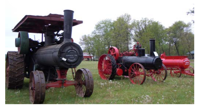
The Advance Rumely went to southwestern Wisonsin, the M. Rumely was bought by the Club, and the water was bought by a Club member.