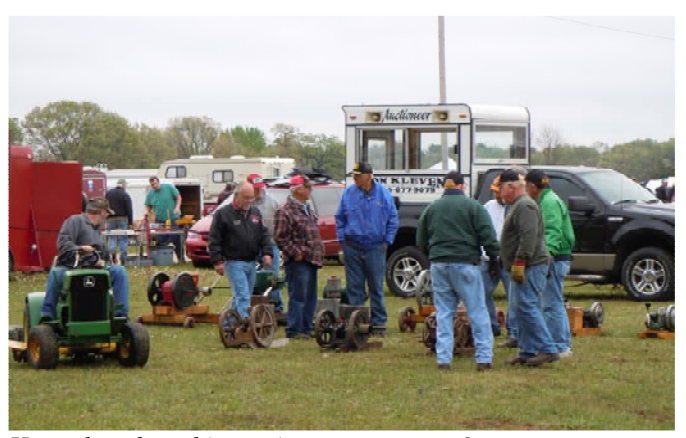
Hey, when does this auction start, anyway?