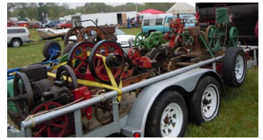
A nice load of engines for the flea market