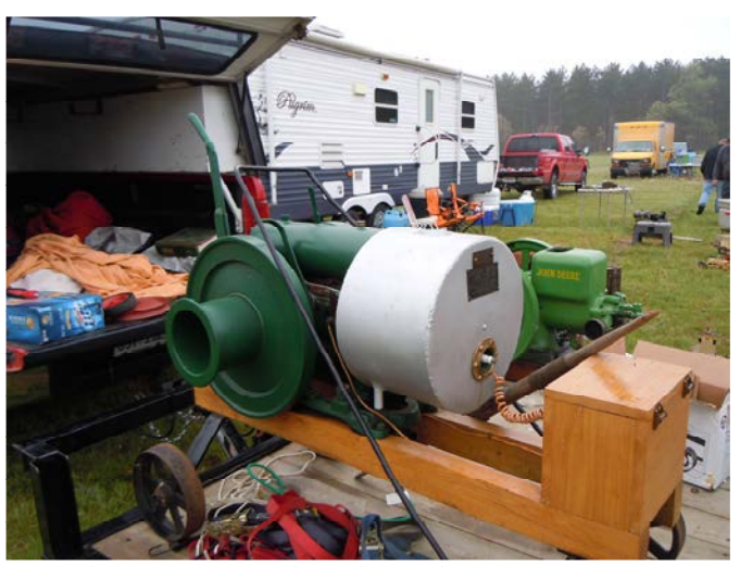
A Woolery engine for sale in the market.