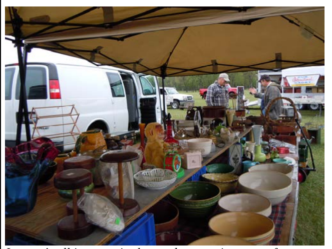
It wasn't all iron out in the market – antiques, crafts, toys, garden ornaments, and all manner of things were for sale. Hey, it's Wisconsin – there must be some Packer clothing out there somewhere. Isn't it the law??