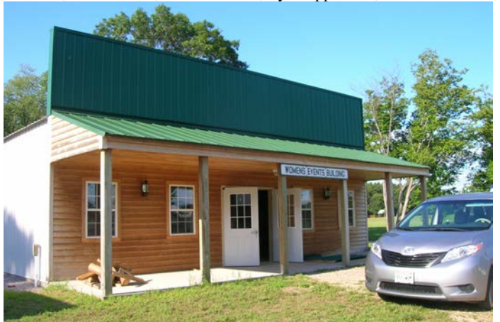
July 16 Another gable project was finished. The Women's Events Building gable had wood siding which was weathering badly. It was difficult to access for maintenance, so after several discussions on the topic, it was finally covered in metal, the same green as the roof.