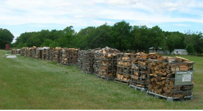
June 7 A group of 12-14 of the steam engine/railroad guys were splitting wood for the Kewanee Boiler and for use in the engines at the show. They had three splitters and cut up 39 cubes worth of wood. Bob Hoege and Paul Young split a lot of wood over the winter, but it was good to get it all done.