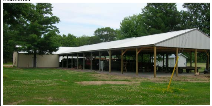
July 5 Sooo, what has changed here? Note the new Ice Cream building tucked in against the picnic shelter. And there is a new 30 ft. extension at the front end of the picnic shelter. Count back 4 posts from the front corner; that is the new addition. A tree was removed to make room.

More photos of work on the Vintage Gas Station and other projects can be viewed at <a href="https://www.badgersteamandgas.com">www.badgersteamandgas.com</a>