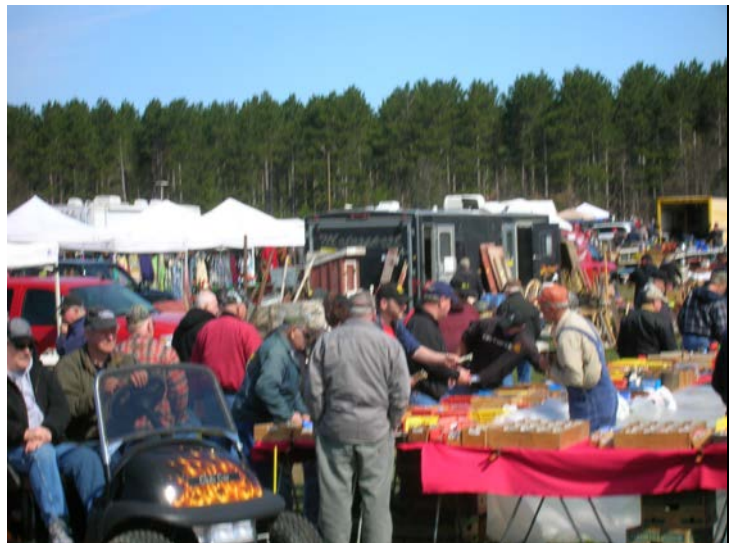
Nothing wrong with the Saturday turnout at the Swap Meet!