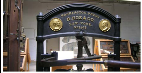
A beautiful iron handpress on display at the Hamilton Wood Type and Print Museum, complete with gleaming golden medallions.

This year the trip had 47 participants. We went to the eastern part of the state again. The first stop was at the Kohler Factory, which included a three hour walking tour of the foundry and the pottery. Lunch was eaten on the bus as we headed to Two Rivers. It was a lovely day, and driving along the lake shore we could see the ice still on the lake. Once at Two Rivers, we toured the Hamilton Wood Type and Print Museum, and also two smaller museums, the Washington House and the Historic Farm Museum. We had to split into smaller groups for these museums, and each of our groups visiting the Farm Museum was able to identify some of the "whatsits" there. The Type Museum has proved to be an inspiration to our very own Print Shop. Many from the groups enjoyed ice cream at the Washington House. Supper was at Schreiner's Restaurant at Fond du Lac, and after that, there was what seemed like a very long drive back to Baraboo! The trip turned a profit again this year, and of course it was donated to the Club.