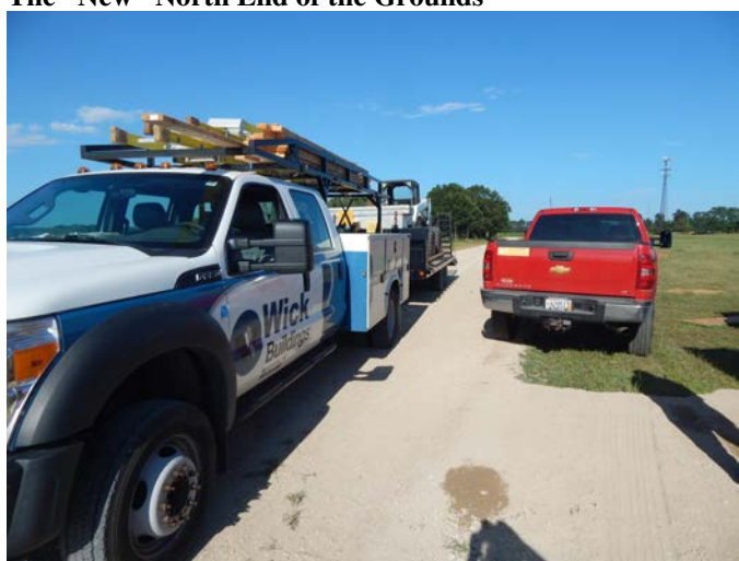
The new north road is in use already.