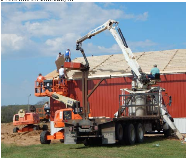
to this (and more) on Friday was amazing to watch and enjoyed by all who saw it.

This building was the talk of the Swap Meet, with most people keeping an eye on the Hartje Lumber crews at work. Now completed, it will serve as a shaded seating area for the Sand Box during the show, as well as home to a satellite Club Pop Stand and the Saturday night Rumely steam