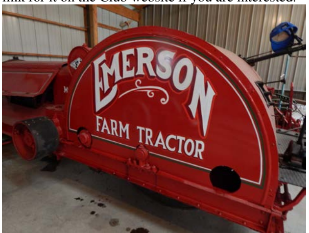
This rare and beautifully restored Emerson Model L tractor was on display at Paulson's.

We all boarded the bus again, and headed to Illinois for the last stop on the tour, which was Paulson's Agricultural Museum of Argyle. The visit there was for over 2 hours, with a leisurely tour of 5 buildings and the many, many items in this giant collection. There were tools, cast iron seats, hog oilers, engines, tractors, implements, washing machines, corn items, signs, memorabilia, gas station items, toys, pedal tractors, and even more. This museum is non-profit, and the people there were very hospitable. There is a link for it on the Club website if you are interested.