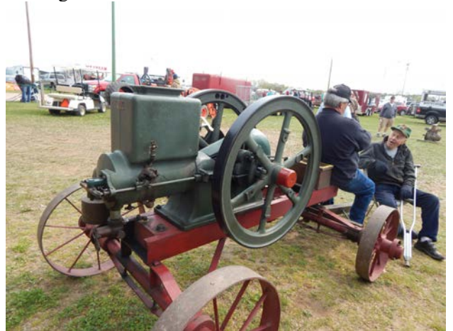
Waiting for the auction to begin is easier when you have a rare gas engine to perch on. This is a 7 hp Steiner "Longlife" engine, made by Steiner Mfg.Co. of Plymouth, WI.

was a big crowd attending. There were some interesting items for sale and a good assortment of items, so all in all, it was a good sale.