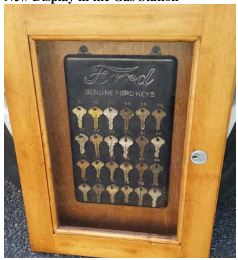
This rare Model T Ford keyboard from a dealership belongs to member Tom Ripp.