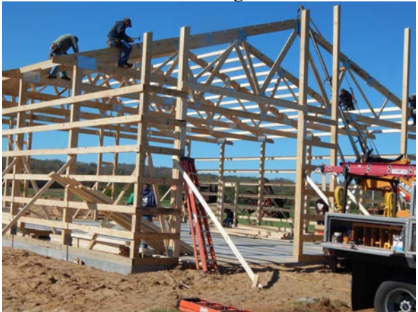
From this on Thursday...