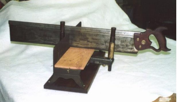
Donated by an unknown person, this cast iron miter box was manufactured by Langdon Miter Box Co. of Miller Falls, Mass., pat'd 1896. Langdon was the first to build an all metal miter box.