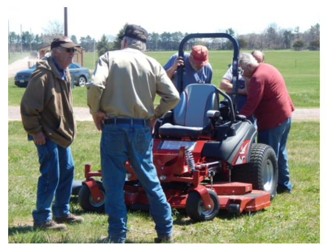
On Cleanup Day, the Club's new Ferris riding mower gets the once over for final approval of the purchase.