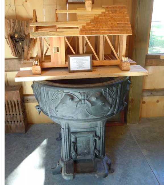
Lyle Opperman's beautiful salesman's sample of a covered bridge is atop a beautiful cast iron feed cooker. These were made in several sizes, and were sold by Sears & Roebuck in the early 1900s. This one is a smaller size, some were considerably larger. (2011)