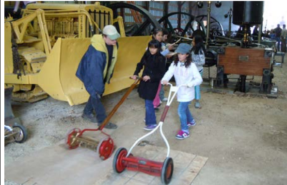
At left, lawn mowing brigade, Kid's Day, 2013. It was too rainy to mow outside.