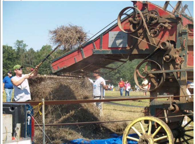
Clover hulling in 2008, using the late Walt Meisel's clover huller.