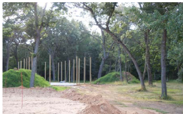
Where is this mysterious place? It looks like the ruins of some ancient mound culture, tucked away in the forest. Oh, wait – it's the Fuller & Johnson Museum Annex construction site last summer.