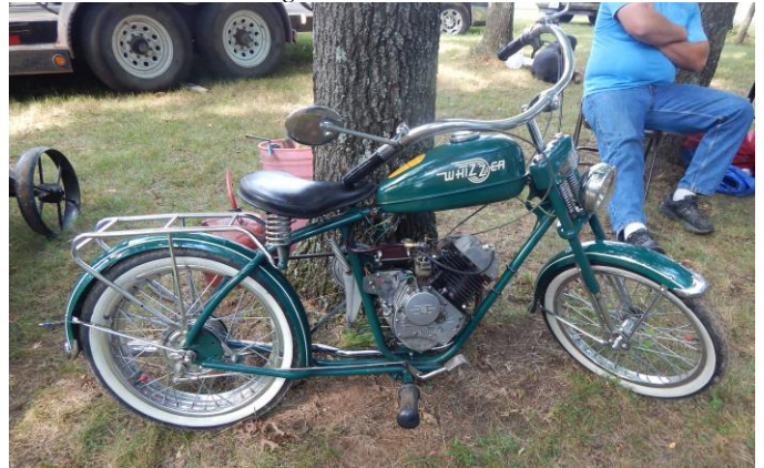
No running boards on the Whizzer though. Owner unknown.