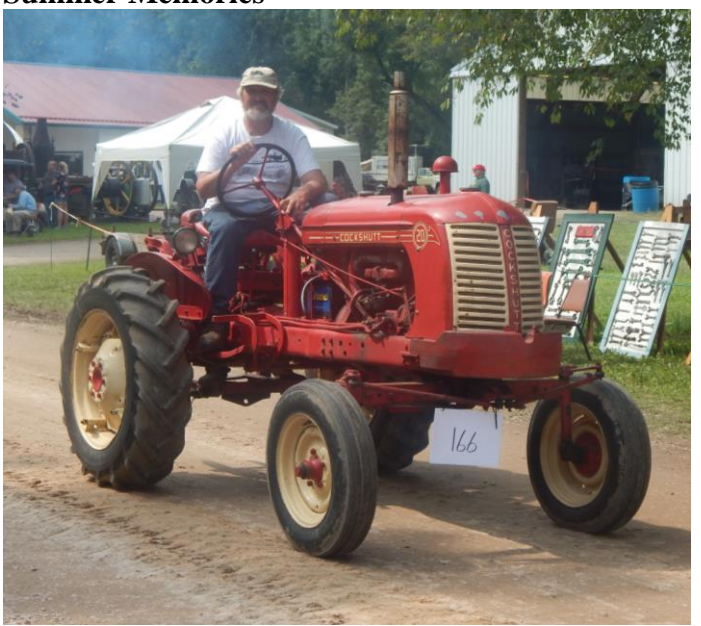
Of course he's smiling – it's a beautiful day, and he's driving a nice Cockschutt Model 20 tractor, which looks like it may have original paint.