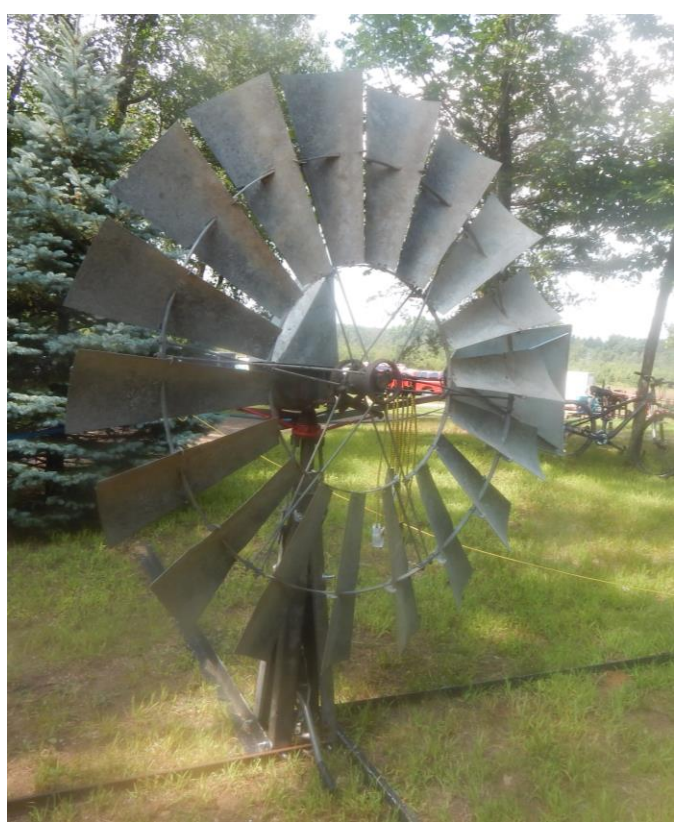
Peter Young of Muscoda brought this Aermotor windmill to last year's show. It's nice to get a closer look at it without having to climb the tower.