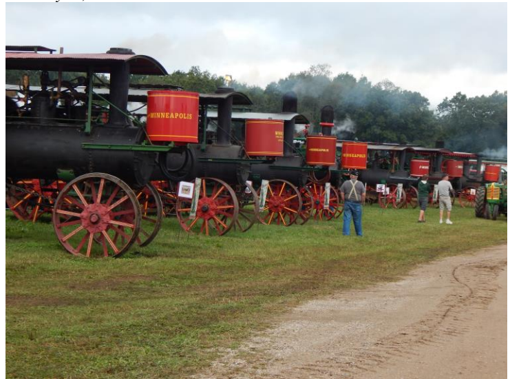
The Minneapolis steam engines were set up in a crescent which really set off the beauty of the engines. Each engine had its place, marked by a very nice poster with the owner's name and engine information.