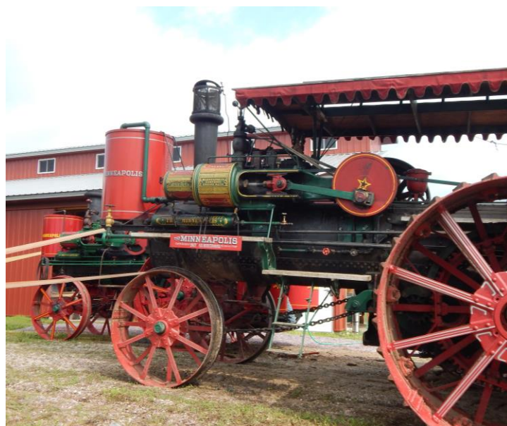
This 1907 Minneapolis 45 hp is the only one remaining of 7 of this model made. It dwarfs the smaller engine which is also belted up at the Hug Mill.