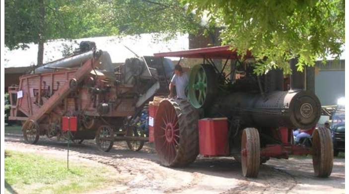
The rare Illinois steam engine rounds the corner during the parade. It was made in Sycamore, IL.