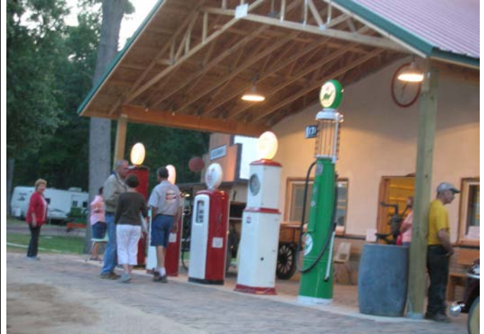
The new Gas Station at night, with the antique pumps lit and people gathering round on a warm summer evening. Where's the pop machine with the 6 oz. green glass bottles of Coca Cola?