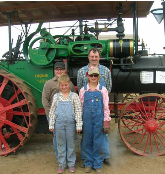
The Wahl family of Marytown obligingly posed with their 1921 Model K 15hp Farquhar steam engine.