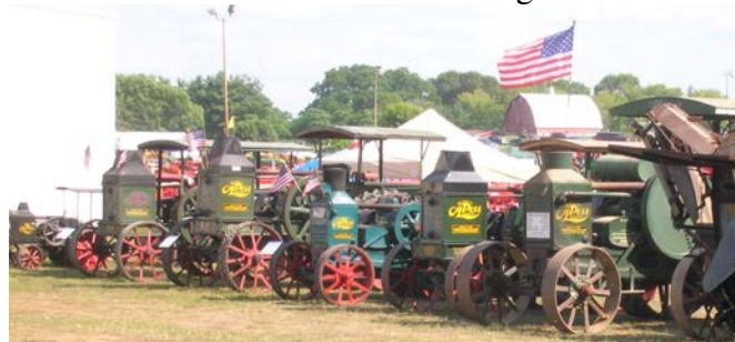
Part of the Rumely lineup this year.