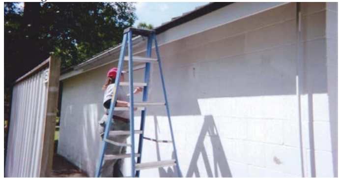
A long overdue painting job on the restroom building was very neatly completed by Kim Phelps, "just in time" for the show.