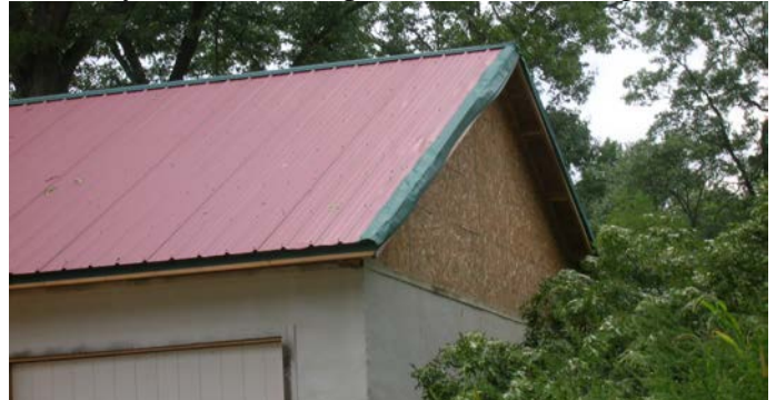
Roof damage on the Gas Station, from downed tree at right.

roof was bent. No insurance claim was filed, as the damage to the building was so slight. The tree scraped along the back wall of the building, leaving a brown streak on the stucco, but the stucco held firm. A tree fell between the Blacksmith Shop and the Model Building, neatly missing both of them. There were more trees and a lot of branches down, but we were very, very lucky. Some of the trees that came down had probably been weakened by oak wilt, but others were seemingly healthy trees. Cleanup of storm debris is mostly finished, except for sticks on the ground.