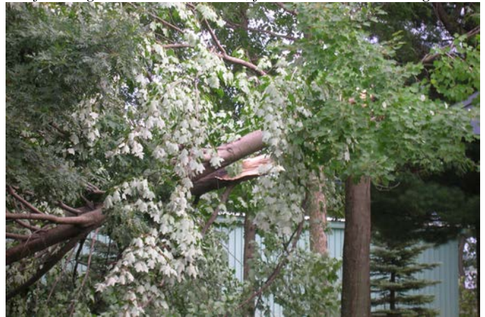
Most trees were broken off several feet above the ground.