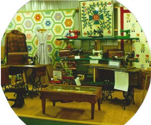
"History of the Sewing Machine" display, by Jan Sprecher-Bruski