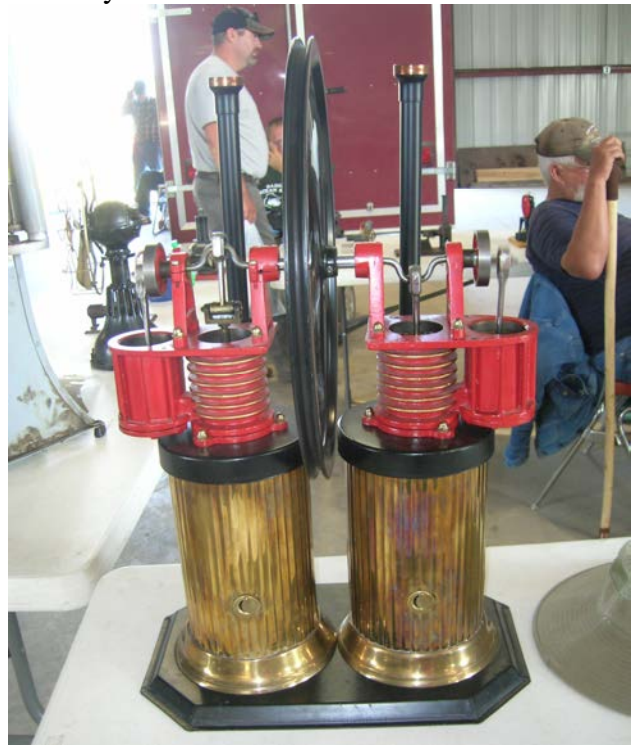
The Duplex hot air engine is actually two engines on a common crank shaft. One runs clock-wise, the other runs counter clock-wise. Each is heated by a small pilot burner, using propane.

All in all, it was a good show, although so many projects this summer took its toll on our worker members. Perhaps next summer will be bit more leisurely.