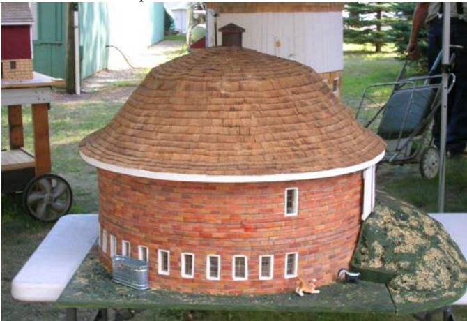
This beautiful model of a round barn was one of a group of model barns displayed by J. Hanke of Viroqua.