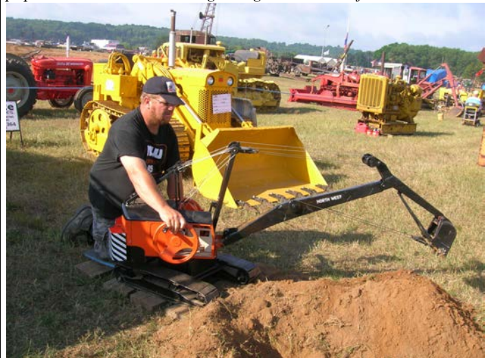
"Sand Box" participants included the small...