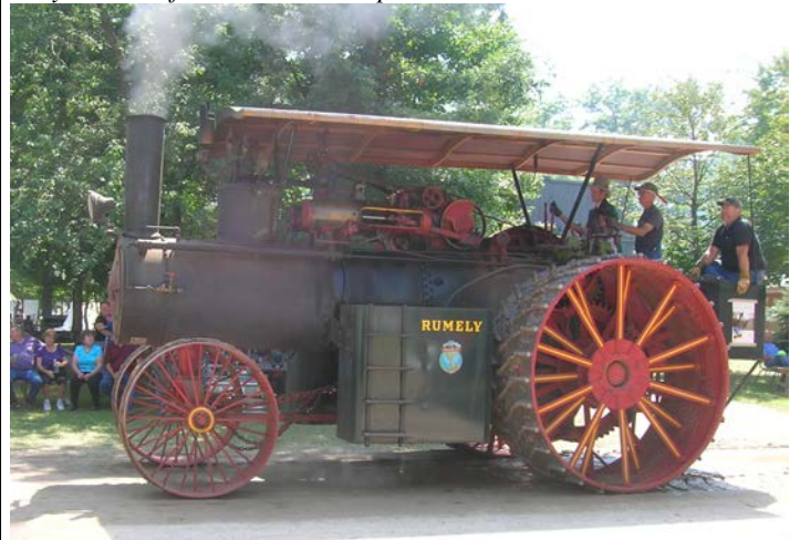
The 1911 36 hp Rumely double steam engine rolls majestically down the parade route with a smiling David Fuller on board.