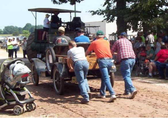
How embarrassing – running out of gas during the parade and being passed by a baby stroller...!