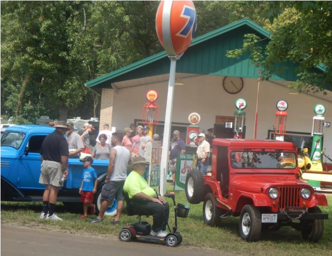
The Gas Station drew a standing room only crowd on Saturday morning, all enjoying the sunshine, the different vehicles, antique pumps, signs and much more.