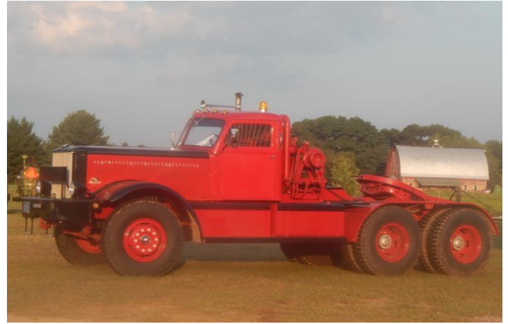
This nicely restored Diamond T truck is equipped with a Tulsa Manufacturing Co. winch. Owner is unknown.