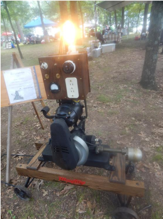
1947 Maytag Light Plant, 110 volt, 250 watt AC.