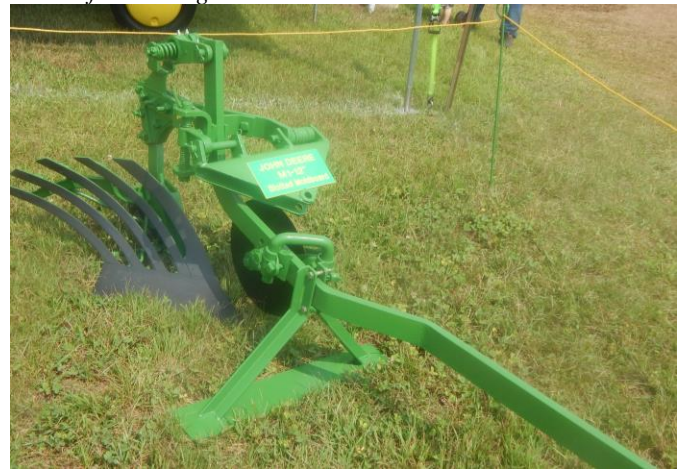
John Deere M1-12 inch slotted moldboard plow, owner unknown.