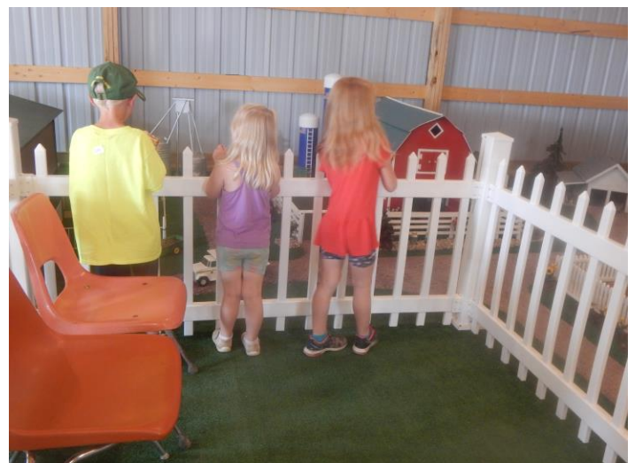
And a happy result.