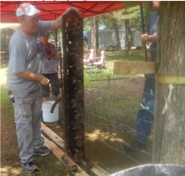
Making woven fence.