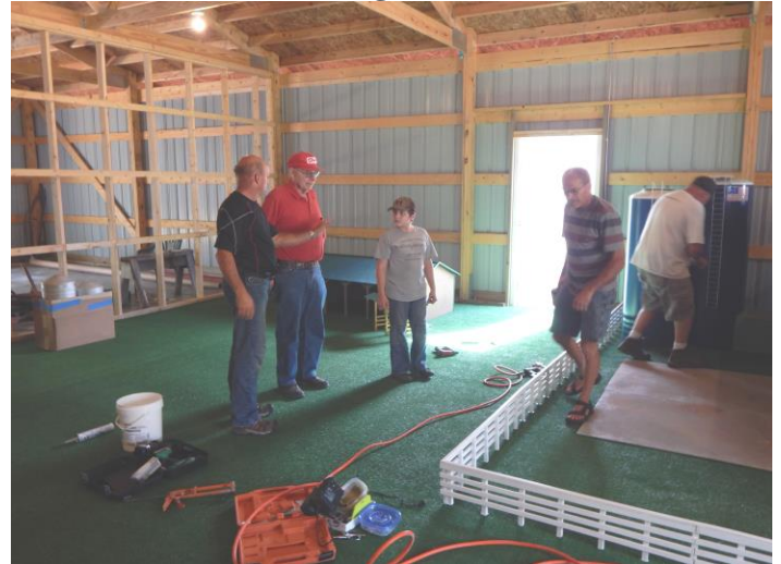
A work in progress...