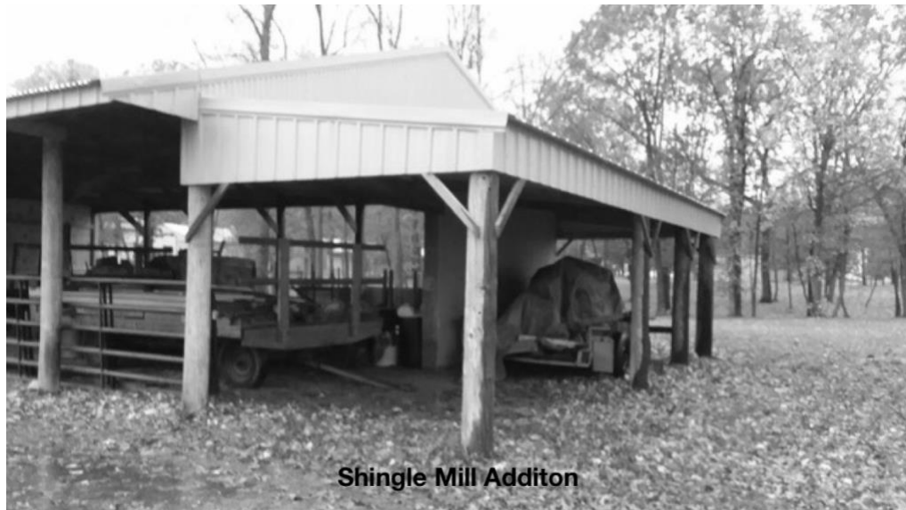
Shingle Mill Additon