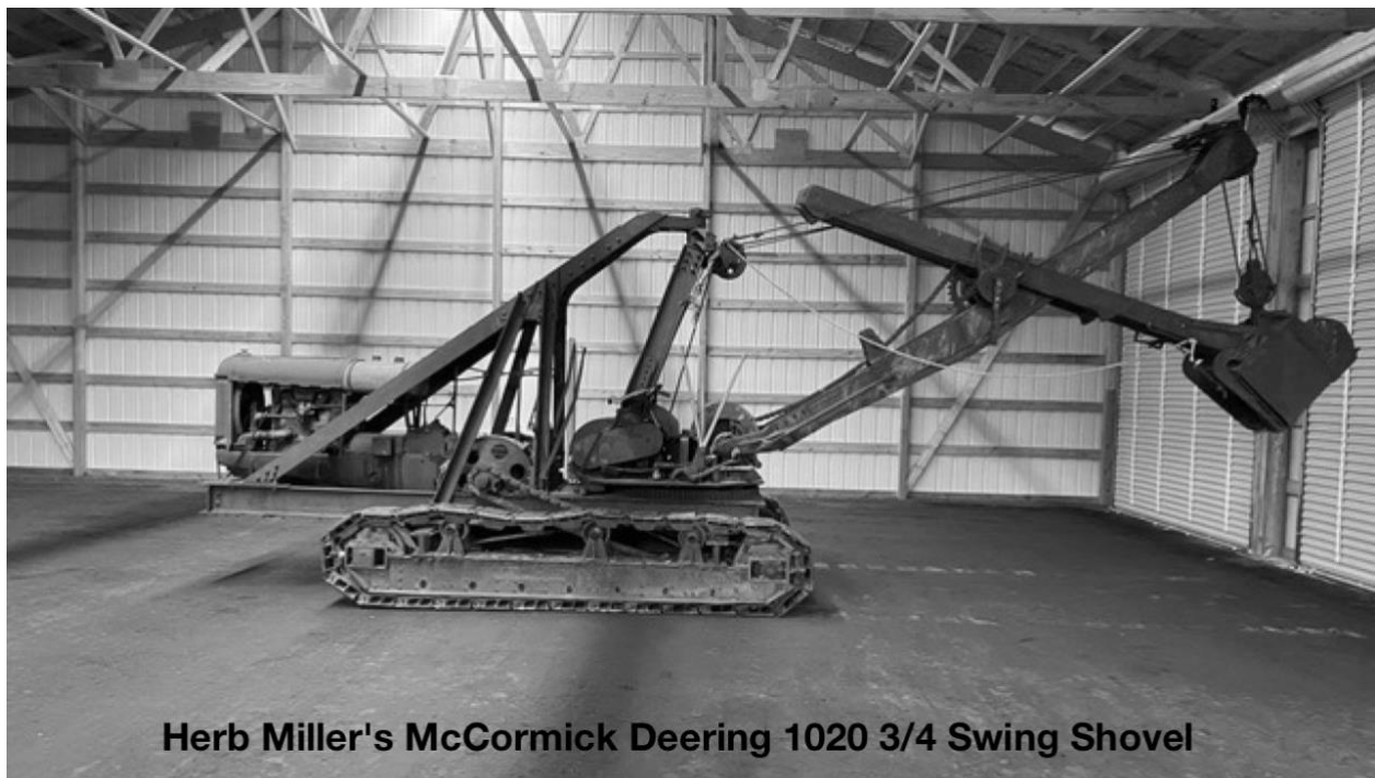
Herb Miller's McCormick Deering 1020 3/4 Swing Shovel